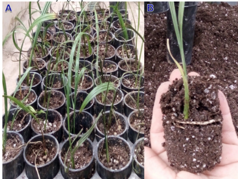
Fig. 3: Date palm plantlets after acclimatization for 3 months in greenhouse; plantlets treated with sorbitol 0.3 M exhibited good vegetative growth (A) and root elongation (B).